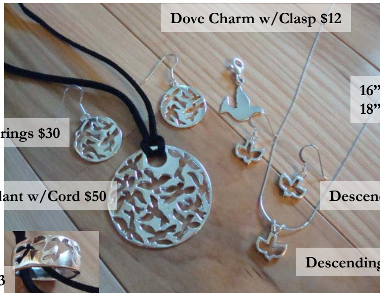
Dove Charm w/Clasp $12